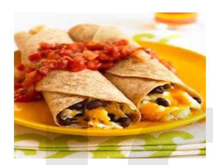
Breakfast and Health