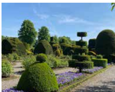
Leven's Hall Gardens