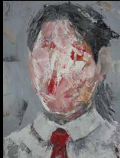
(above) Faceless Acrylic painting by Coehan McCue