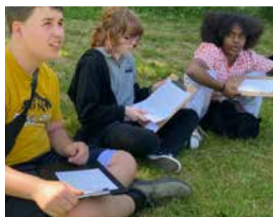
Charcoal, paper and relax...