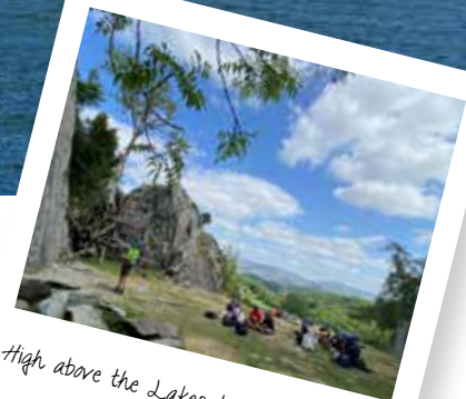
High above the Lakes...