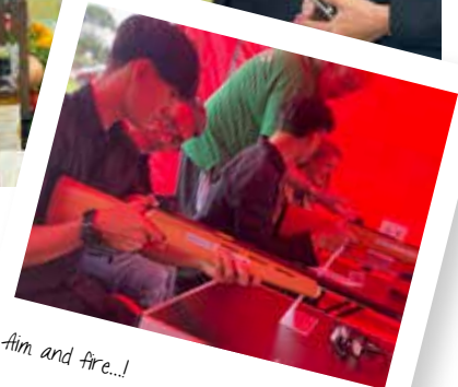
Aim and fire...!