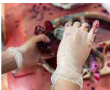
Such a mess! But worth it for the results