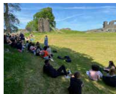
Sketching at Kendall Castle