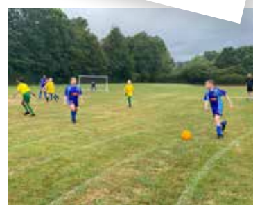
A wet but amazing football tournament