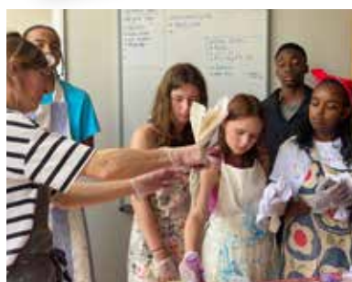
The colour choice was fab.