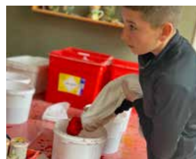
Carefully does it!