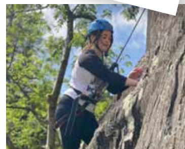
So proud of our pupils for facing fears