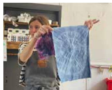
A quick tie-dye lesson