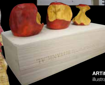
ARTificial Intelligence Multimedia illustration by Oliver Rocke