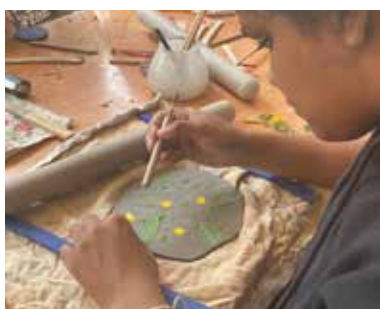
Creating patterns with flowers on clay