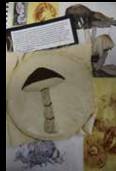
Sketchbook by Ella Trew