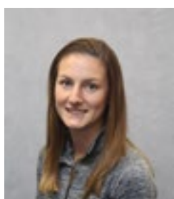
Miss Bignall Cover Supervisor