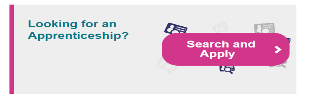
Home > Apprenticeship Search