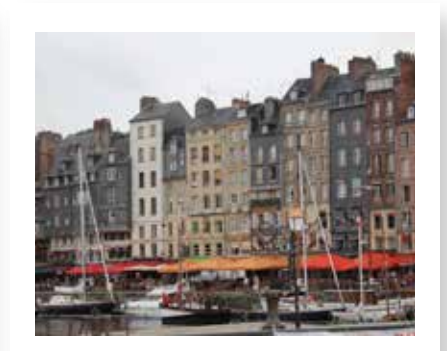
Port de Hornfleur