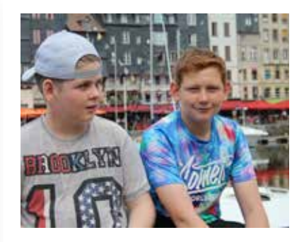
Sitting, chatting and just chillin'