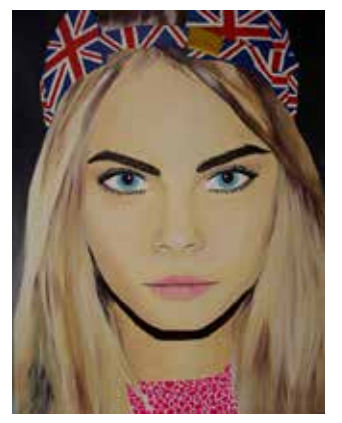
Urszula Fydrych - Acrylic Painting