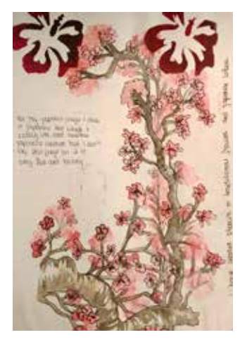
Watercolour 'Blossom' by Eleanor Kellerman