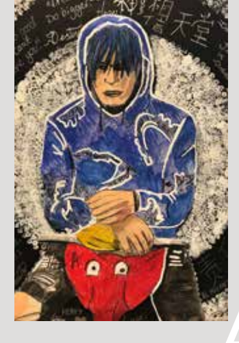
Watercolour 'Hoodie!' by Anton Walisch