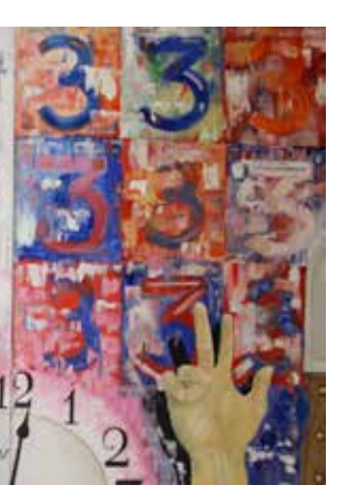
No.3 (Triptych) by Elana Hobbs