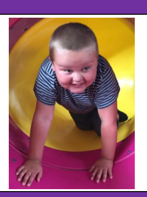
Ages 5-11 years