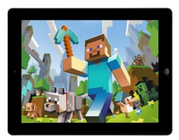
Ages 8-17 years 5:30 pm - 6:30 pm £4.00 per session

This group supports young people with their self esteem, confidence, and social skills by engaging in a fun activity with shared interests.