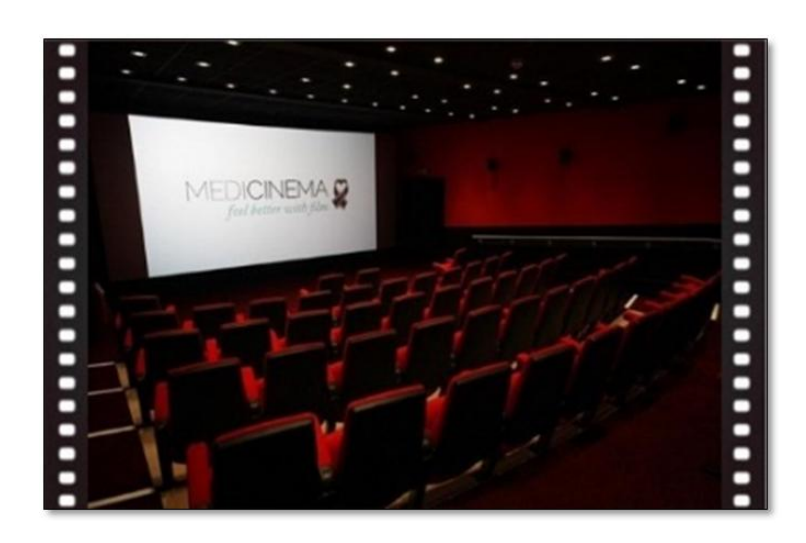
Ages 0-18 years Tues -6.30pm Sat - 10.30am free

Come and watch a 2D or 3D film as a family!