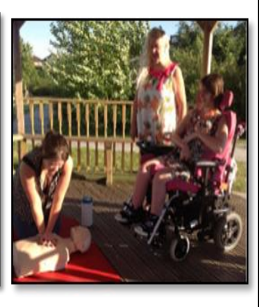
Ages 16-17 5:30pm-7:30pm £5 per session

Supports young people with a disability or developmental difficulty with their transition into adulthood. The club provides opportunities to learn and develop new skills such as communication, cooking, cleaning, managing finances, confidence, working as a team etc.