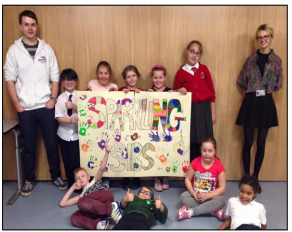
Ages 7-11 4:30 pm – 6pm £2

This is a club open to siblings of children and young people with a disability or developmental difficulty. The siblings are provided with an opportunity to relax, have fun and meet other siblings who share similar experiences.