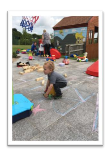
Ages 0-4 years 10.00 am - 11:00 am £3.00 per session

This is a fun and friendly session that offers a planned programme of activities to meet the individual needs of the young children and their parents.